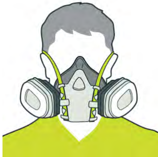
Re-usable half face respirator (cartridge)