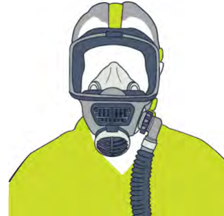
Full face powered respirator (cartridge)