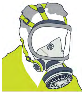
Full face respirator (cartridge)